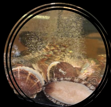
北海道産 活帆立 三重県産 活あわび