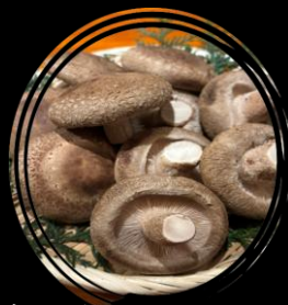
徳島県産 ブランドしいたけ しいたけ侍