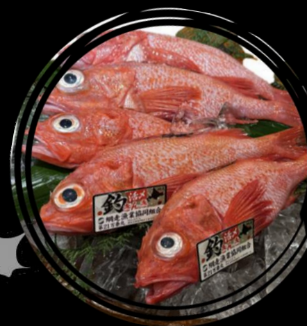
北海道網走産 特選 釣りキンキ